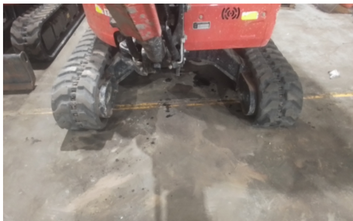
Tyre Condition 4

Australian Hammer Supplies Hire Unit 3/32 Williamson Road Ingleburn NSW 2565